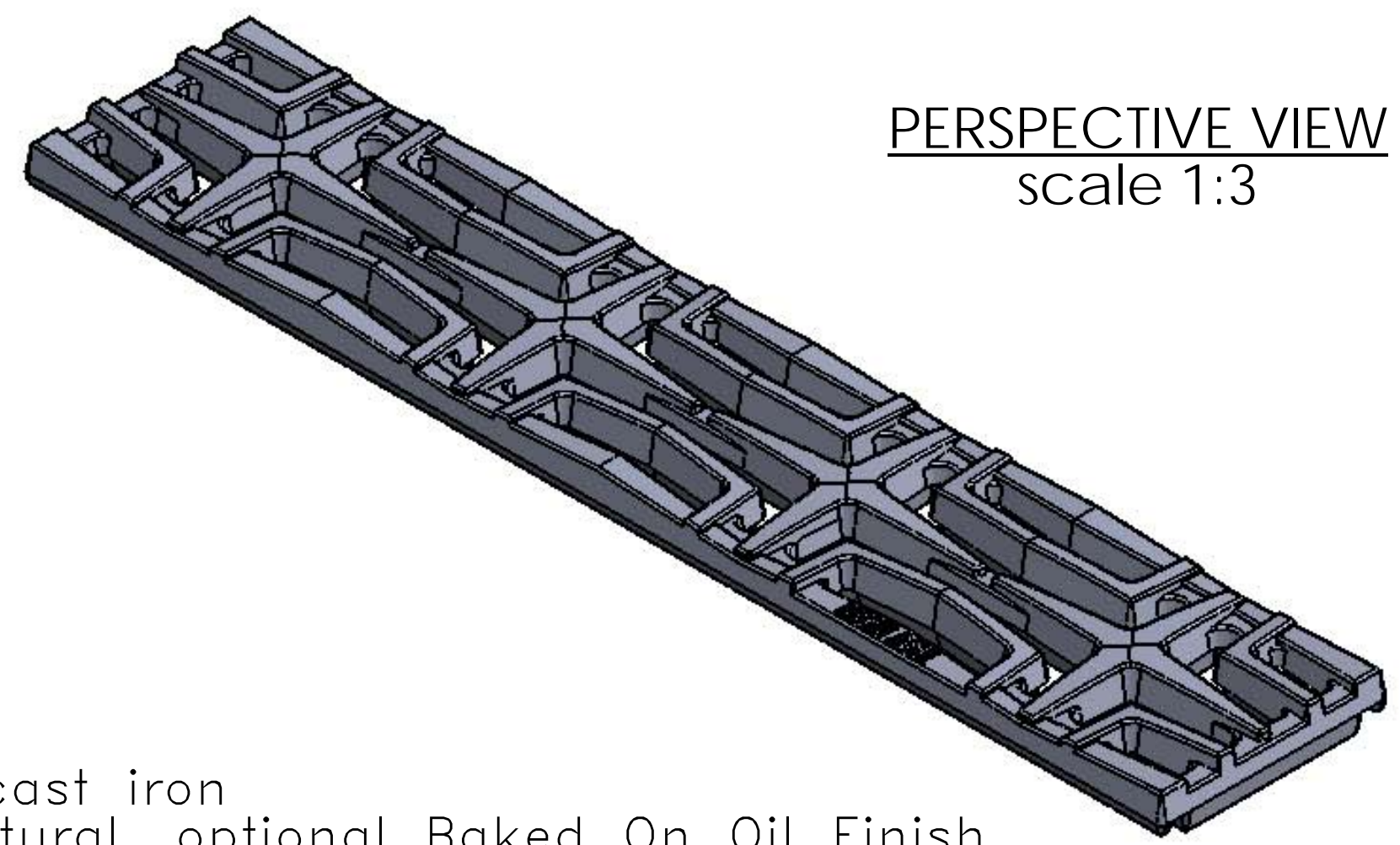
PERSPECTIVE VIEW scale 1:3